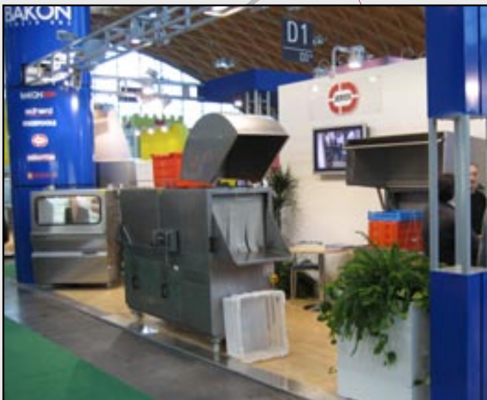
Sigep – Rimini Italy – Bakery/Confectioner Bakon Italia S.r.l.

and thank you very much for the ones that have already been sent to us. Remember that we insert links regarding exhibitions on www.jeros.com "EXHIBITIONS"