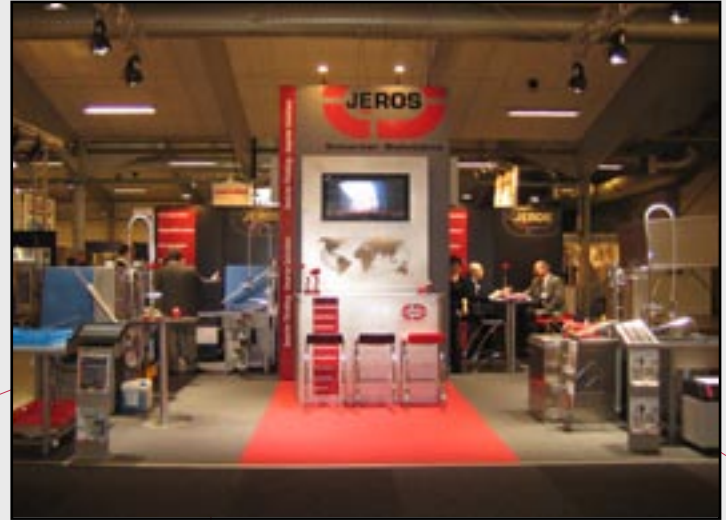
TEMA – Copenhagen – Denmark – Hotel, Restaurant & Food Industry JEROS A/S