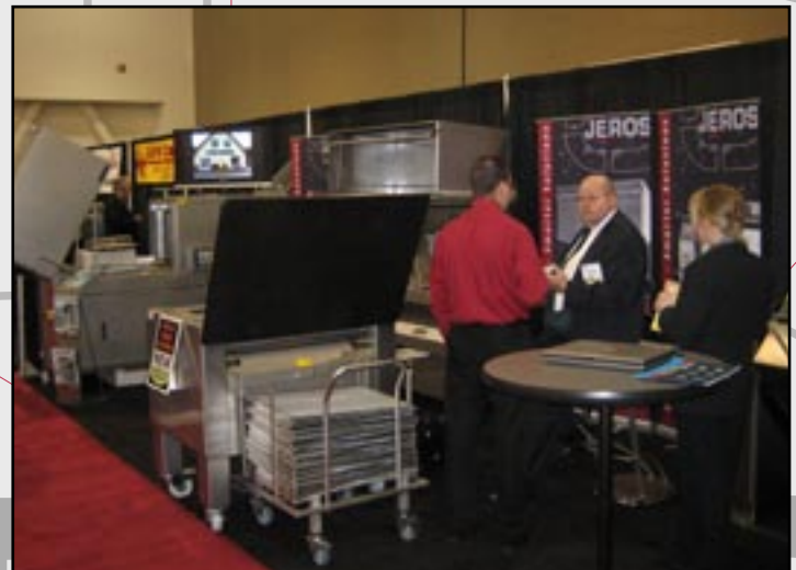
Wisconsin Restaurant Expo – Wisconsin – USA JEROS USA

JEROS stand at the 2007 Wisconsin Restaurant EXPO. The Expo was held downtown Milwaukee, and it included restaurants, bakers, cheese, and beverage makers. Visitors at the booth during the open day of the show. American baker's first look and impression of the tray cleaner was very positive.