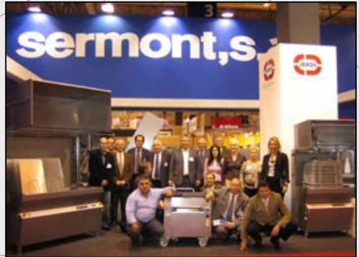
InterSicop – Madrid – Spain – Bakery/Confectioner Sermont s.a.