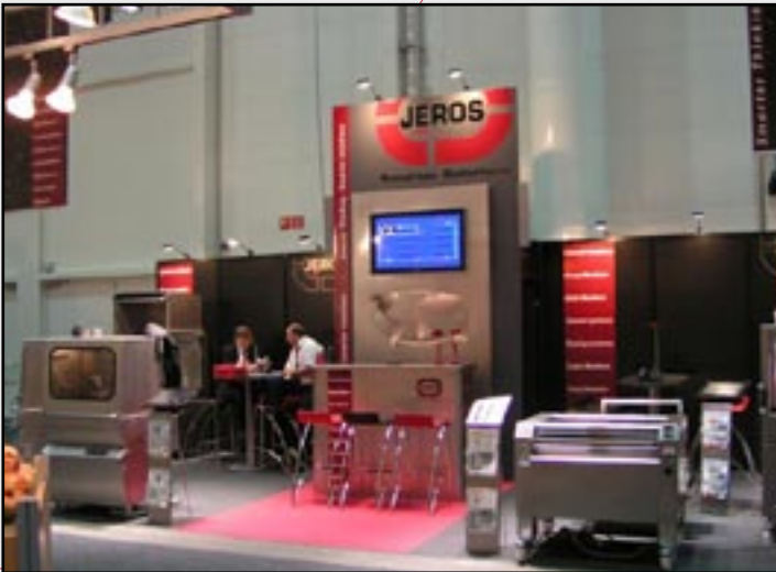
Internorga – Hamburg – Germany – Gastronomy & Bakery JEROS A/S