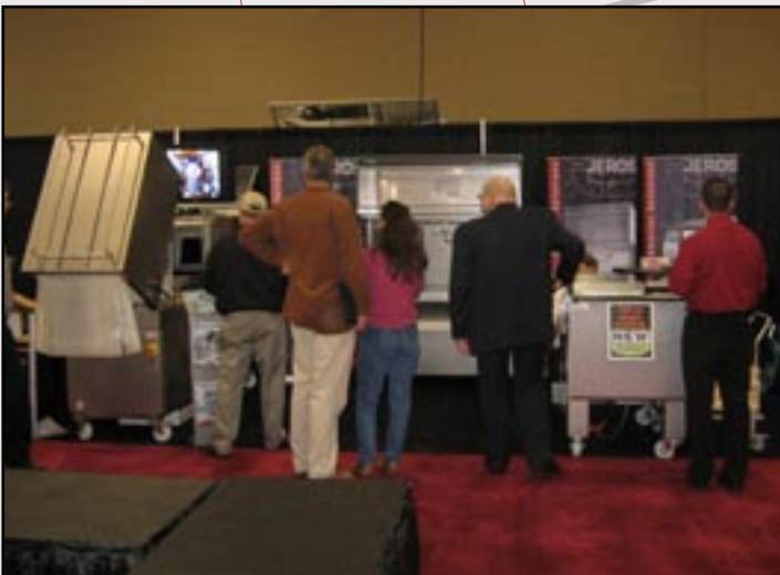
InterSicop – Madrid – Spain – Bakery/Confectioner Sermont s.a.