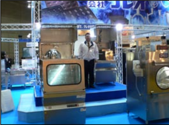
FBK – Bern – Switzerland – Bakery/Confectioner Pitec AG