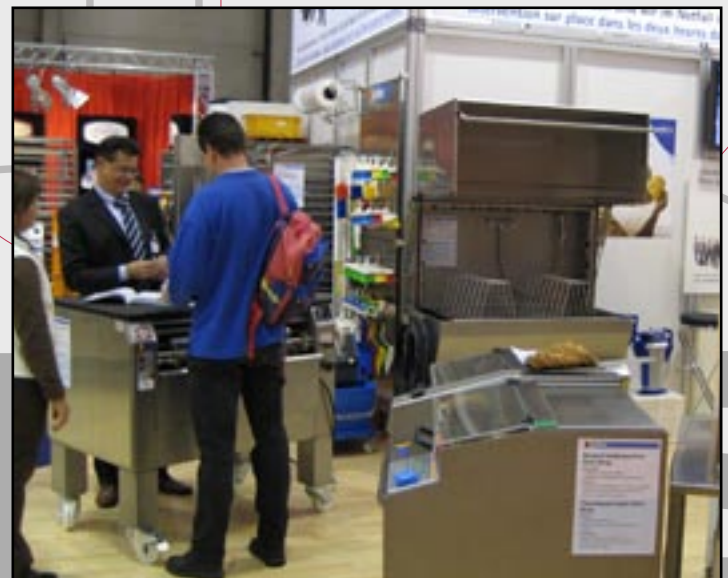
FBK – Bern – Switzerland – Bakery/Confectioner Pitec AG